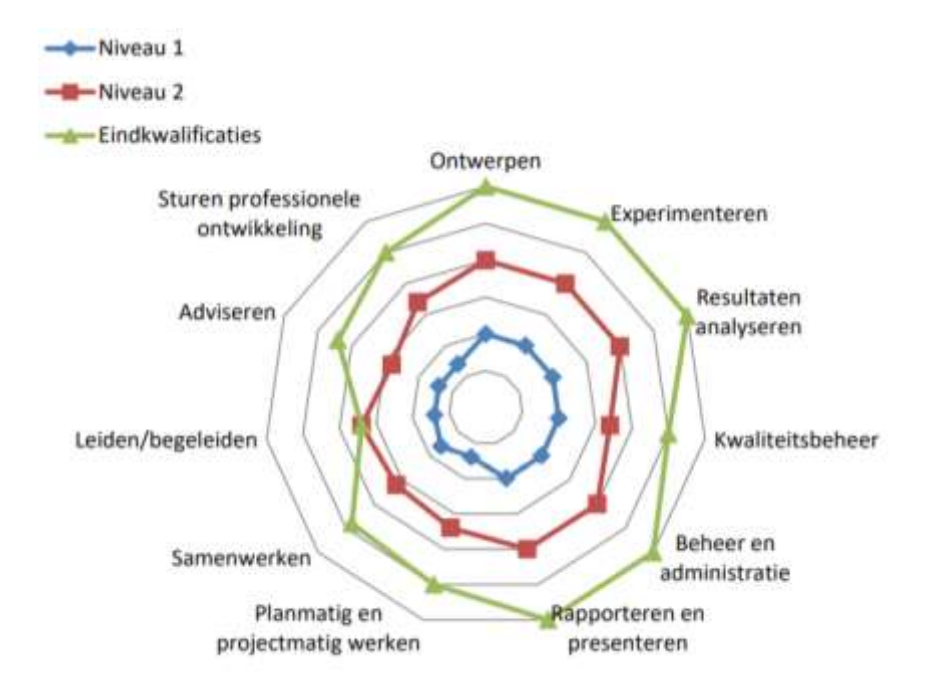
Figure 1: Concentric structure of competence development throughout the curriculum

The national profile does not contain specific international or intercultural competences, but many aspects in the professional field are certainly internationally oriented. For example, think of the scientific literature used, the use of internationally accepted standards and the international context of the professional field. That is why it was decided to make some of these international and intercultural aspects explicit in the competence profile and the more specific underlying learning outcomes.